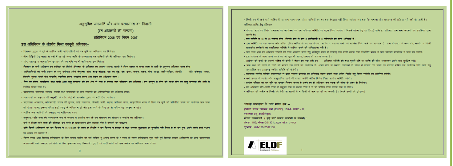
FRA Pamphlet for A2J Project

The Foundation wishes to convert a number of enviro legal researches that the firm has undertaken into simple user-friendly documents in various forms such as monographs, working papers and guidebooks on environment and development law. Members of the foundation have already written a number of books on the sector. However, they are technical and for niche audience. The foundation publishes simple documents to educate key targets audience through resource material as well as lectures and seminars. Members of the foundation have had rich experience and it would be important to coordinate with other experts in developing the education and publication profile.